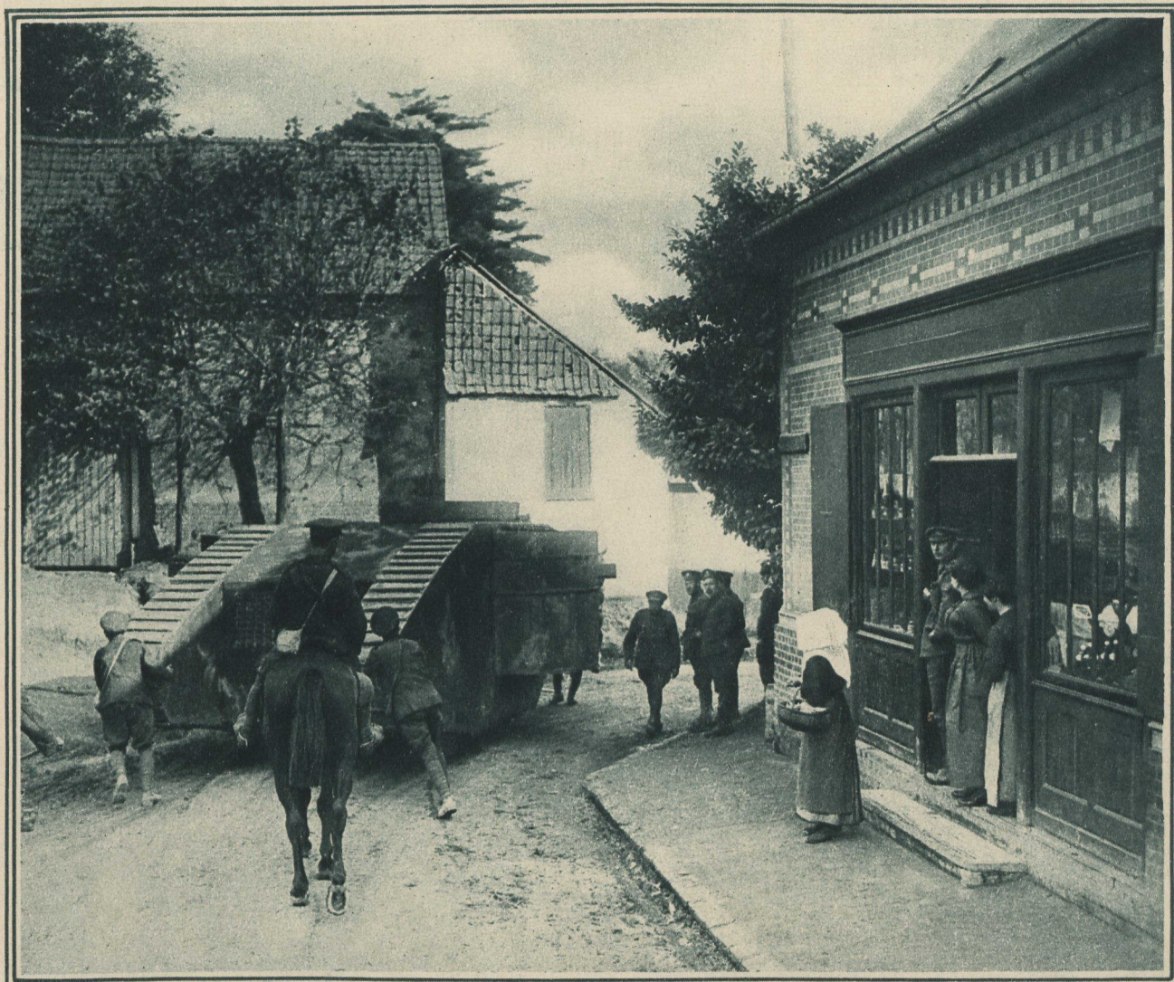
The finest piece of camouflage of the War was effected by the Canadians when they constructed dummy tanks of wood and pushed them up to the front line, where they successfully drew the enemy's fire. One of the dummy tanks being steered through a French village.