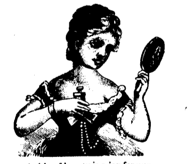
A skin of beauty is a joy forever.

ALWAYS ASK FOR ESTERBROOK PENS Superior, Standard, Reliable. Popular Nos.: 048, 14, 130, 135, 161 For Sale by all Stationers.