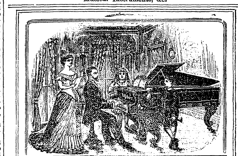
THE WEBER BABY GRAND. RECEIVED HOME.