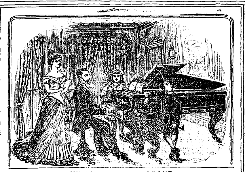
THE WEBER BABY ORAND. RECEIVED HOME.