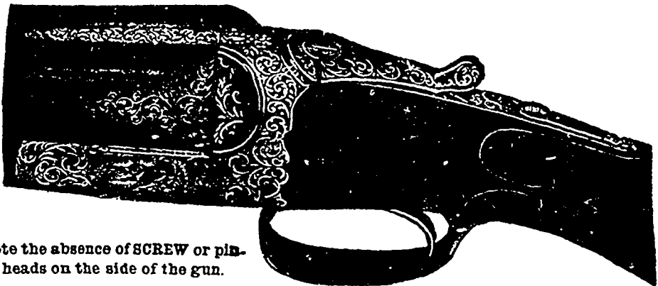
Note the absence of SCREW or pin-heads on the side of the gun.