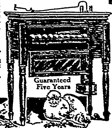
Guaranteed Five Years

The Manson Campbell Co., Ltd. Dept. F39, Chatham, Ont. NOTE— I carry large stocks and ship promptly from branch houses at Calgary, Alta., Montreal, Que.; Brandon, Man.; Halifax, N. S.; Victoria, B. C., and factory at Chatham.