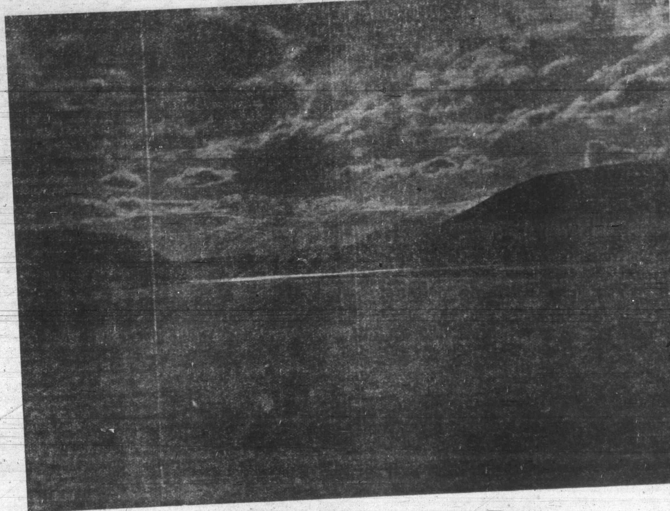
SUNSET ON LAKE LE BARGE.