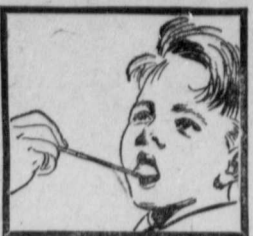
Is your child's temperature normal?

Your children are bound to take risks when they go to school. But you can decrease this risk by giving them Virol, a food which has been proved to increase the power of the blood-cells which resist infection.