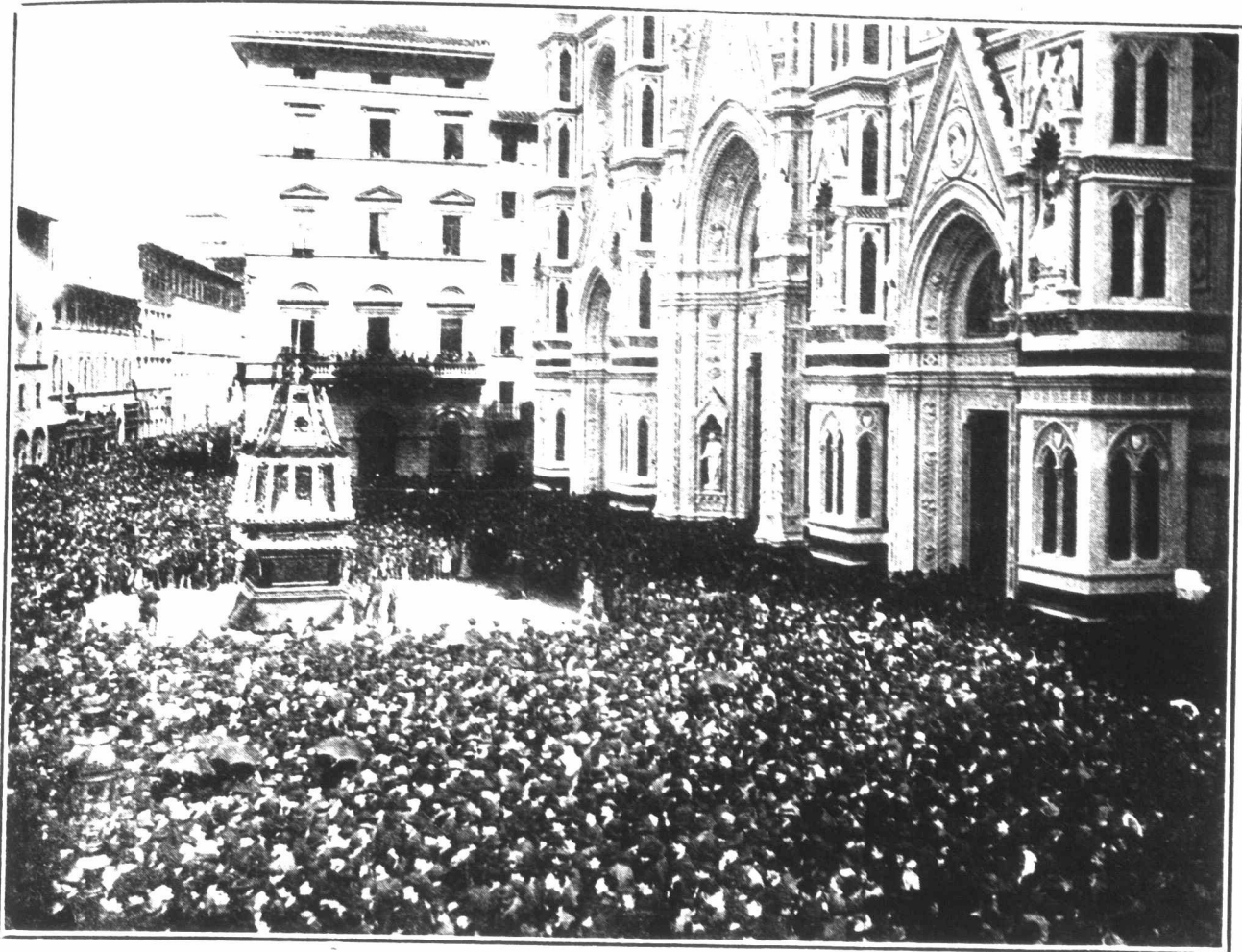
An Exciting Moment in the Spectacle of the Scoppio de' Carro. The Columбина on Its Way to the Car.

we "children of a larger growth" followed in the way of the procession to the Piazza Venezia in Rome, there rises the last of the "no-work" ex-looked