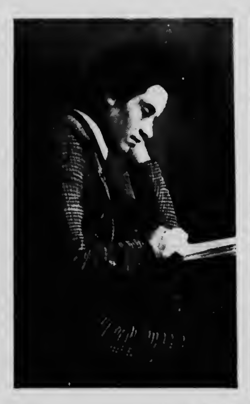
Plate 1—Sandford Fleming at age 18, sailed from Scotland to Canada in 1845.