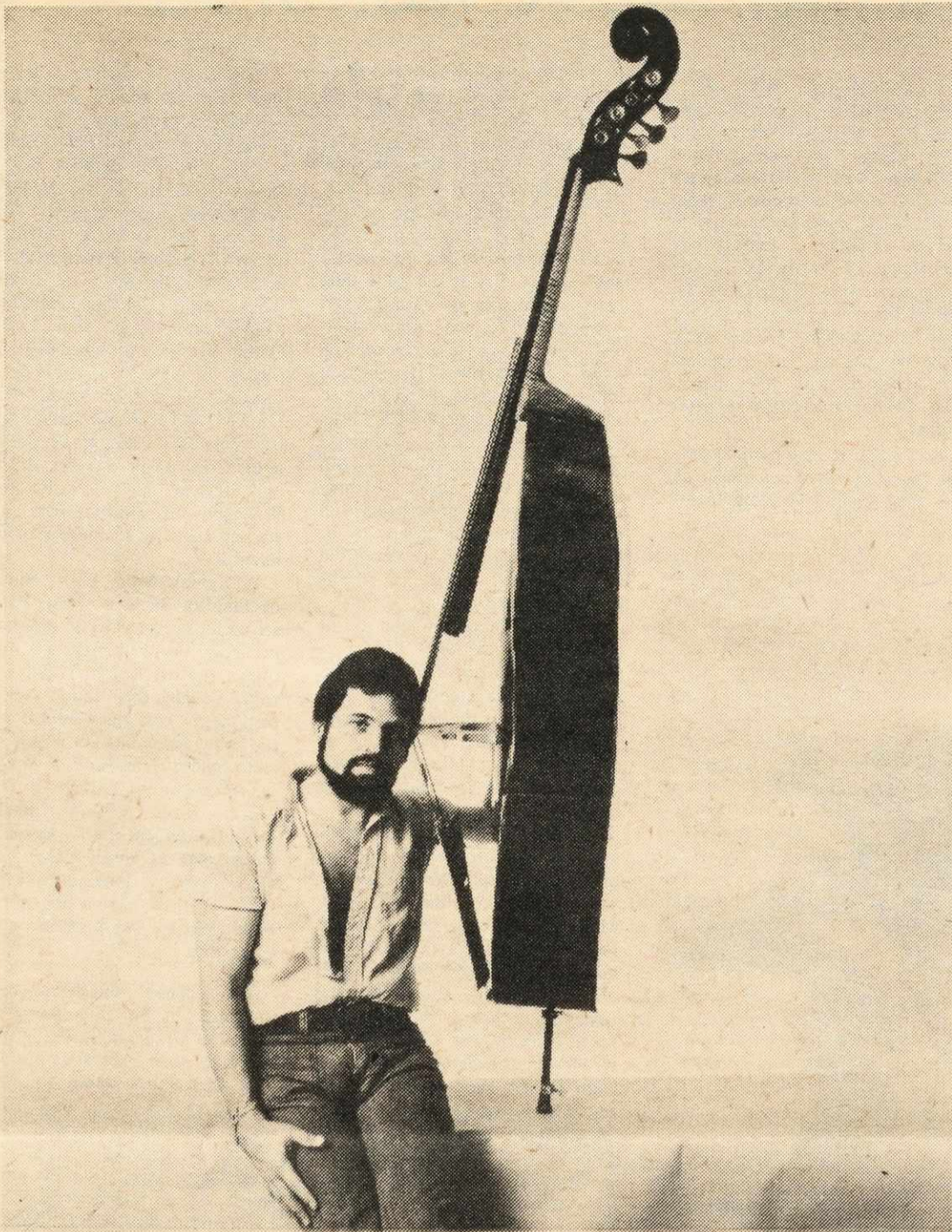
Teams of Dal Medical students have been studying this unfortunate case for several months - you see, the poor lad thinks he has a double bass growing from his ear. Ah, the horrors of psychosomatis....