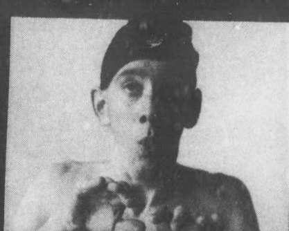
Mark Tewksbury Front Crawl IV

"He's got more Viewpoints than you'll ever have."