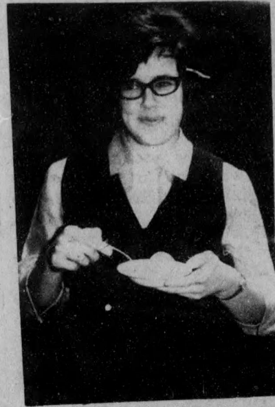
SRC à la mode.