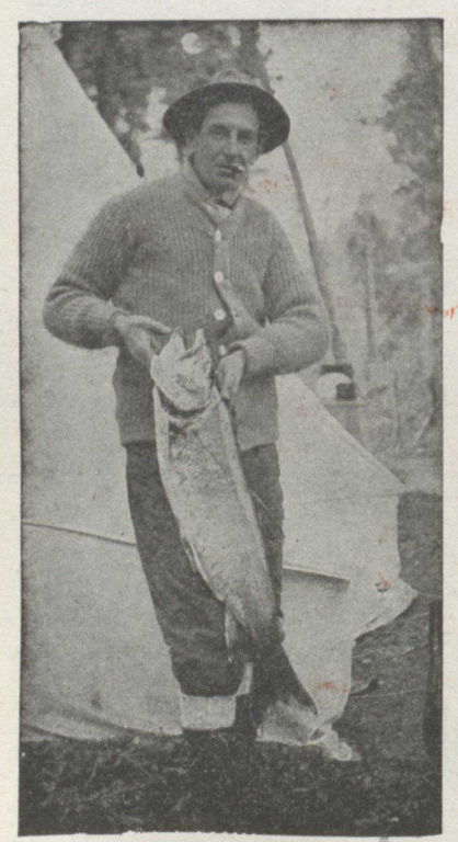
17-Ib. Lake Trout, Grand Prize Winner Field and Stream Contest, 1913, caught Ragged Lake. Algonquin Park, Ont. in

Speckled Trout-May 1st to Sept. 14th. Salmon Trout-Dec. 1st to Oct. 31st following year. Black Bass-June 16th to April 14th following year.