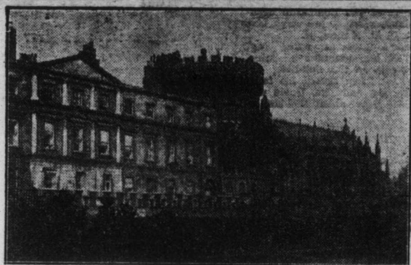
DUBLIN CASTLE The Headquarters of the Provisional Government of Southern Ireland.

The cost of a country home water system employing gas or electricity as power for pumping from shallow wells runs from $100 to $400. These figures do not include piping through the house.