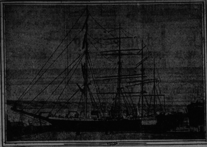
The WILLIAM P. FRYE

AMERICAN VESSEL SENT TO BOTTOM BY GERMAN CRUISER.