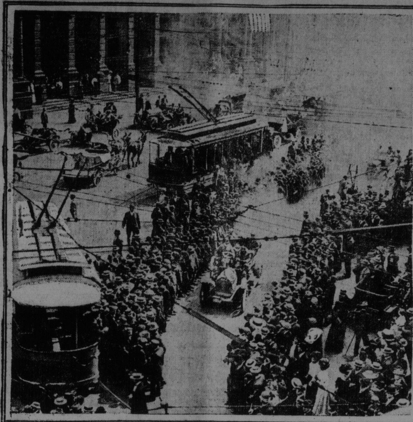
SCENE IN GOVERNMENT SQUARE, CINCINNATI, WHEN 10,000 PERSONS CHEERED THE GLIDDEN TOURISTS AS THEY STARTED ON THEIR LONG TRIP WHICH WILL TAKE THEM 2851 MILES IN 17 DAYS.

Lubrication has more to do with success in the maintenance of an automobile than the average man is likely to realize, and in view of its dual angle, there is an excellent chance for confusion of mind in dealing with this problem, says the Automobile. One not accustomed to the situation might readily be led to the conclusion that quality of the lubricant is about all that has to be taken into account. All the lubricating oil on this mundane sphere would be as pearls to swine in the face of an ill contrived mechanism placed for the purpose of feeding the lubricating oil to the zones which work under pressure, offer a hiding place for the silt of the road, and squeak for want of a slippery surface when the oil fails to arrive on time.