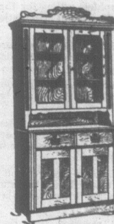
Kitchen Cabinet or China Closet, of Ash Antique Finish, 7 ft 5 in high, 3 ft 8 in wide. Base 3 ft 2 in high, mounted on casters.

This is of handsome design and particularly good value.