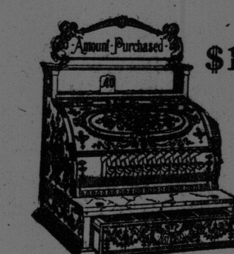
Model 2035 Larger size of this style $125

Full information will be sent on request.