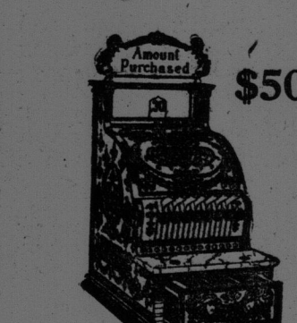
Model 2035 Larger size of this style $75

Nationals are made in more than 500 sorts and sizes.