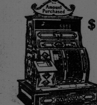
Model 2035 Larger size of this style $150

National Cash Registers insure carefreeness and accuracy.