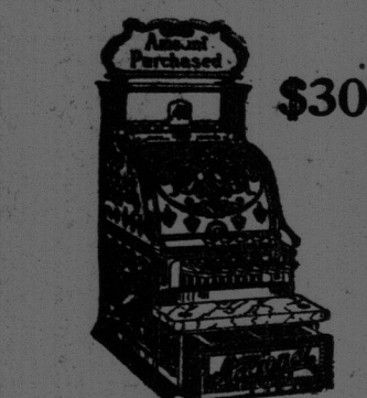
Model 2035 Larger size of this style $45.

No matter who you are, where you are or what you do, if you handle money or keep records, there is a National built to serve your requirements.