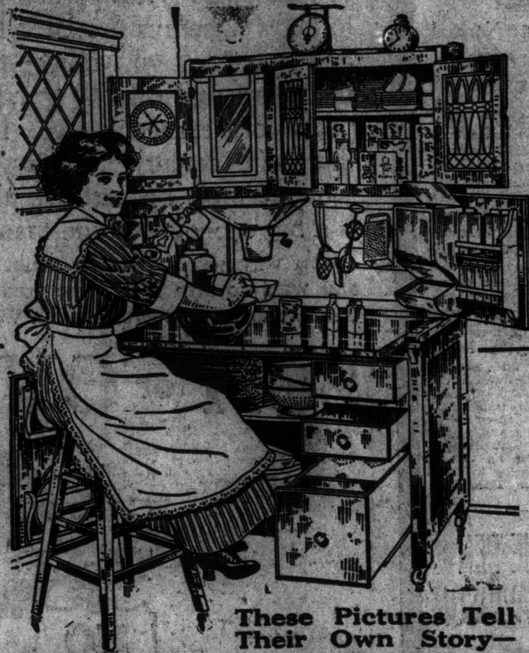
These Pictures Tell Their Own Story—

The Housewife Who Takes Delight in Her Kitchen Work—and