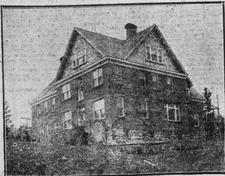
Lady Minto Hospital, New Liskeard