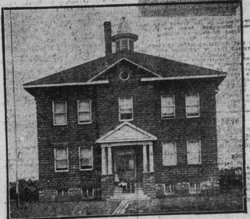
Public School, New Liskeard