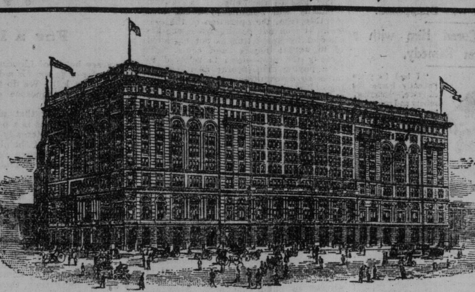
Largest Office Building in the World—Madison Avenue, Fourth Avenue, 23rd Street and 24th Street, New York City.