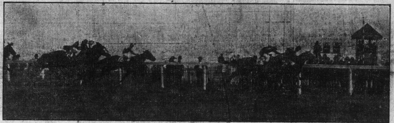
THE FINISH—Kelvin Wins—a neck ahead of Half-a-Crown, Bilberry, Wicklight and Kirkfield following, and Photographer just edging into the picture.