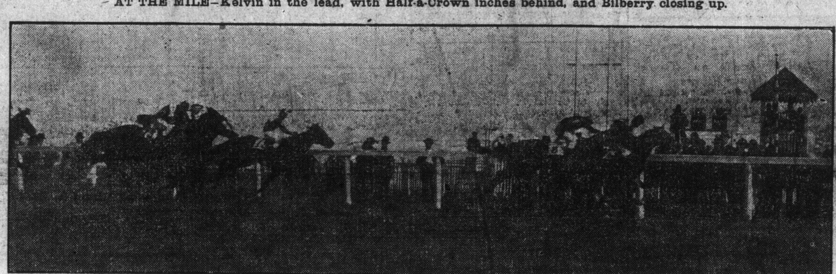
THE FINISH-"Kelvin Wins"—a neck ahead of Half-a Crown, Bilberry, Wicklight and Kirkfield following, and Photographer just edging into the picture.