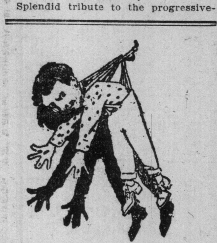
Don't Hang On to the