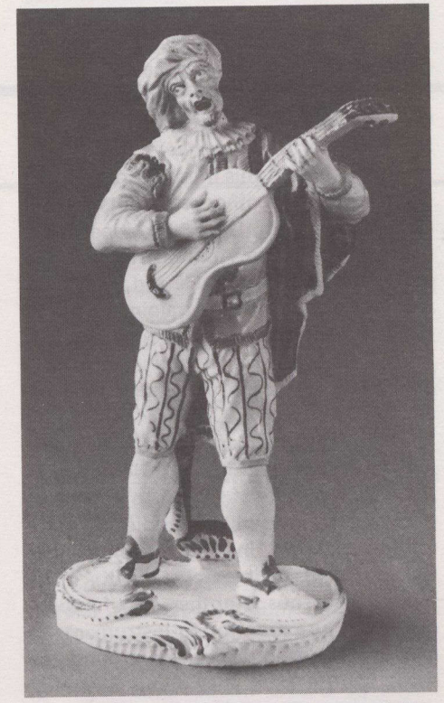
Porcelain figure of Mezzetin, probably modelled by Carl Vogelmann. (Circa 1765).

The collection is divided into four major categories, each representing a particular aspect of ceramic history within a specific time scale: precolumbian pottery, dating from 2000 B.C. until the fifteenth century A.D.; Italian maiolica