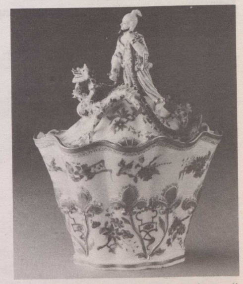
Vienna Du Paquier porcelain hanging wall vase and cover. (Circa 1730).

The precolumbian pieces, the maiolica and the English delftware are in irregularly shaped oak cases trimmed in black metal and placed around the perimeter of the gallery. The space in the centre is reserved for the showing of other private collections.