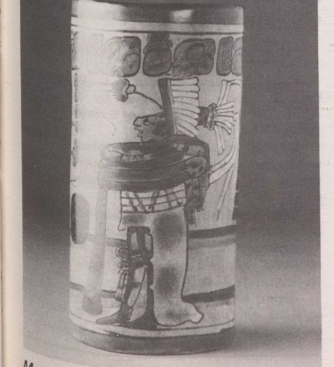
Maya polychrome vase painted with a ball game scene. (Circa 550-950).