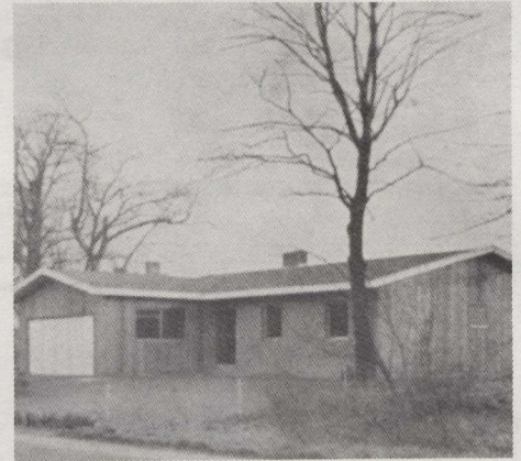
Timber-frame construction has been proved to be both cost effective and energy efficient.

Telex: (destination code 42) 280806 (CANADA 280806F).