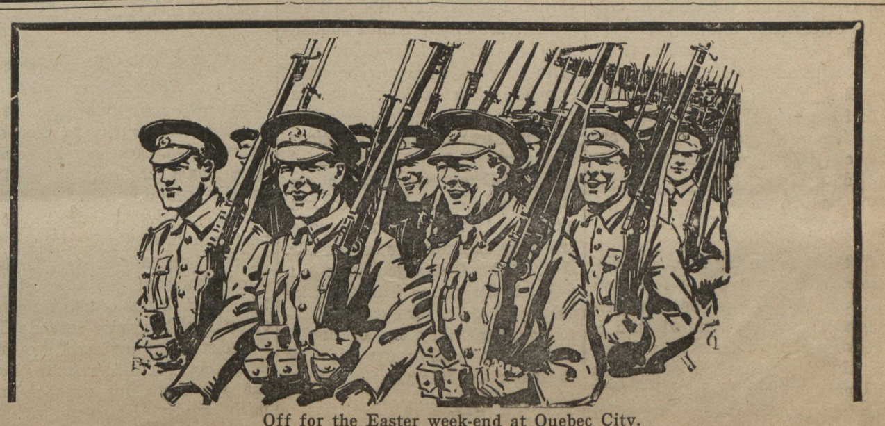
Off for the Easter week-end at Quebec City.

The first element, in point of nearness to the enemy, is the "outpost" line. This may be posts at the ends of zigzag trenches leading out from the first continuous trench or "firing line" proper.