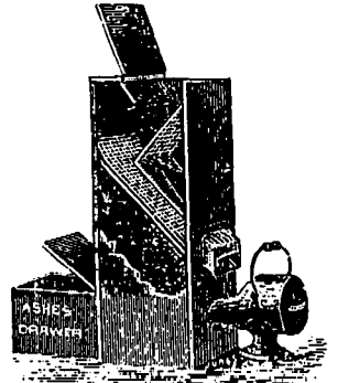
AUTOMATIC 'DUSTLESS' Cinder Sifter.

A—Urine Separator. B—Urine Receptacle. C—Excrement Tank.