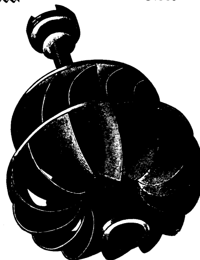
Cut Showing Wheel Removed from Case.

84 per cent. of power guaranteed in five pieces. Includes whole of case, either register or cylinder gate. Water put on full gate or shut completely off with half turn of hand wheel, and as easily governed as any engine.