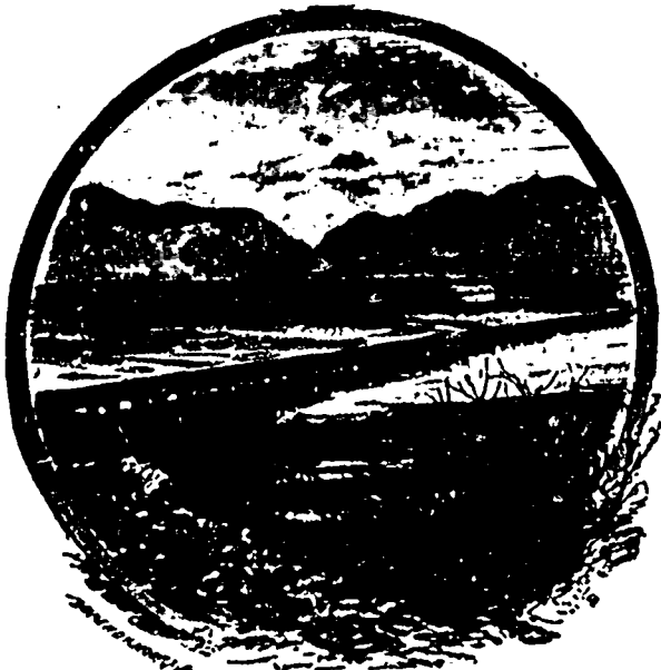
SALT LAKE VALLEY.