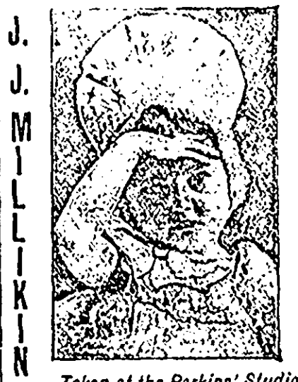
Taken at the Perkins' Studio $2.50