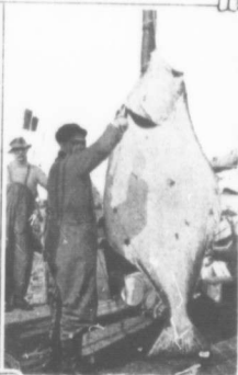
Halibut weighing 180 lbs.