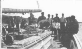
Typical Canadian Deep-sea Fishermen