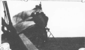
Furling Jib in a Blow