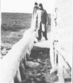
Winter Fishing in North Atlantic