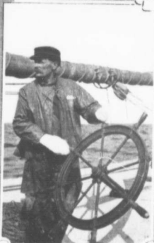
Typical Canadian Atlantic Skipper