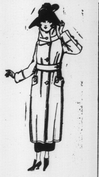
Exact Copy of Wrapper.

The New Fall Coats are arriving each week. Already we can give you a nice assortment. No two Coats alike. Write, Phone or call and inspect, which is better.