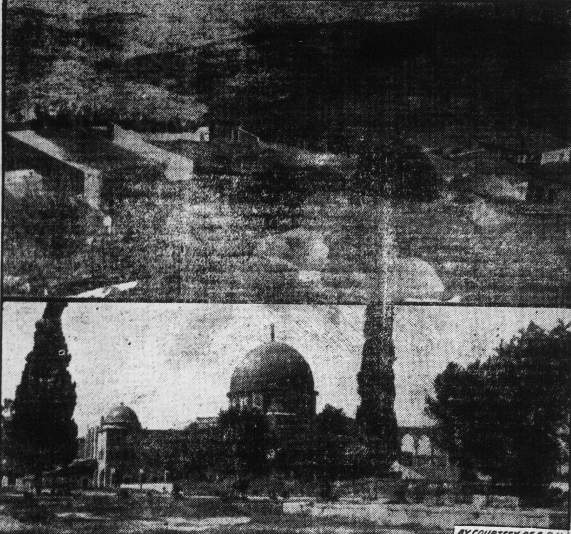
The upper picture is a view of Omar taken from the top of the wall. Beneath is back view of the famous Mosque of Omar.