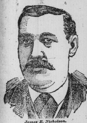
CANCER ON THE LIP

Ayer's The Sarsaparilla Admitted at the World's Fair. AYER'S PILLS Regulate the Bowels.