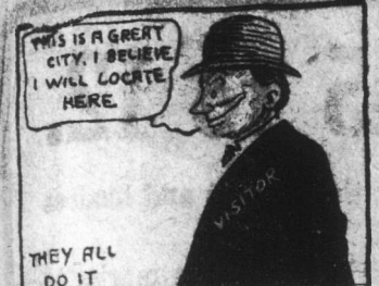
THEY ALL DO IT