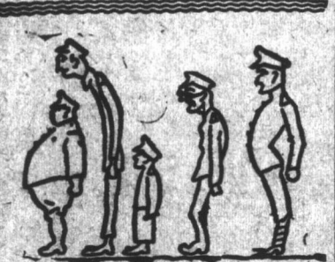
Bulletin No. 6.

—de Captain of the C.C.C. Band was at dinner.