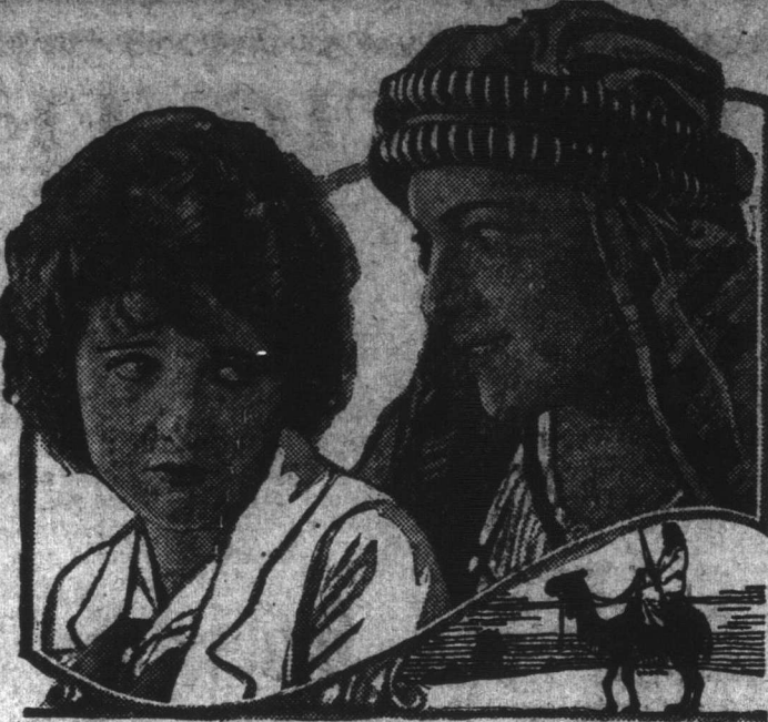
Agnes Ayres and Rudolph Valentino in a scene from the Paramount Picture, "The Sheik," a George Melford Production.