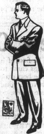
PROGRESS BRAND CLOTHING