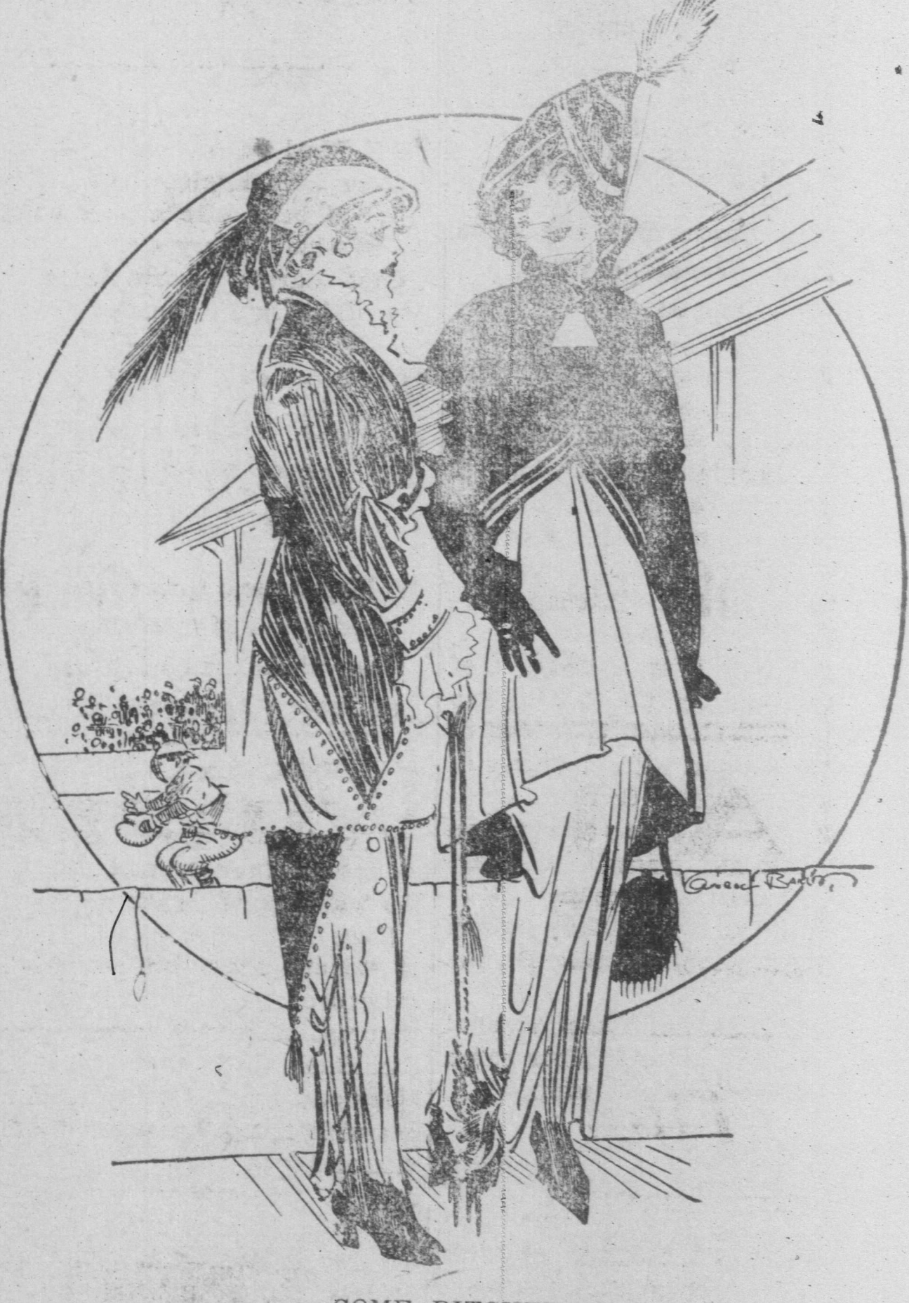
SOME PITCHER My! Isn't the man who throws the ball for our side just wonderful! Indeed he is; he throws it so they hit it every time.

If you want a nicely finished Headstone or Monument, see our stock, or write for our Catalogue of sizes and prices, and our mail order system. We give first-class stone sockets with all stones. Beware of cheaper imitations now in the market. First-class always. Second to none. First-Class Lettering a Specialty. Catalogue of prices sent to any address on receipt of Post Card.