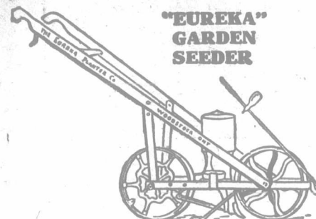
"EUREKA" GARDEN SEEDER

These tools are Labor and Money savers and should be on every farm and garden. Our method of making these specialties assures adaptability, strength and service at the minimum price for the best goods of their kind on the market.