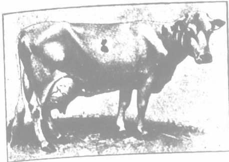
Pontiac Rag Apple (58980).

AT THE VILLAGE OF INKERMEN, ON TUESDAY, NOVEMBER 1st, 1910