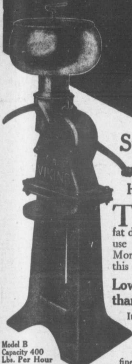
Model B Capacity 400 Lbs. Per Hour