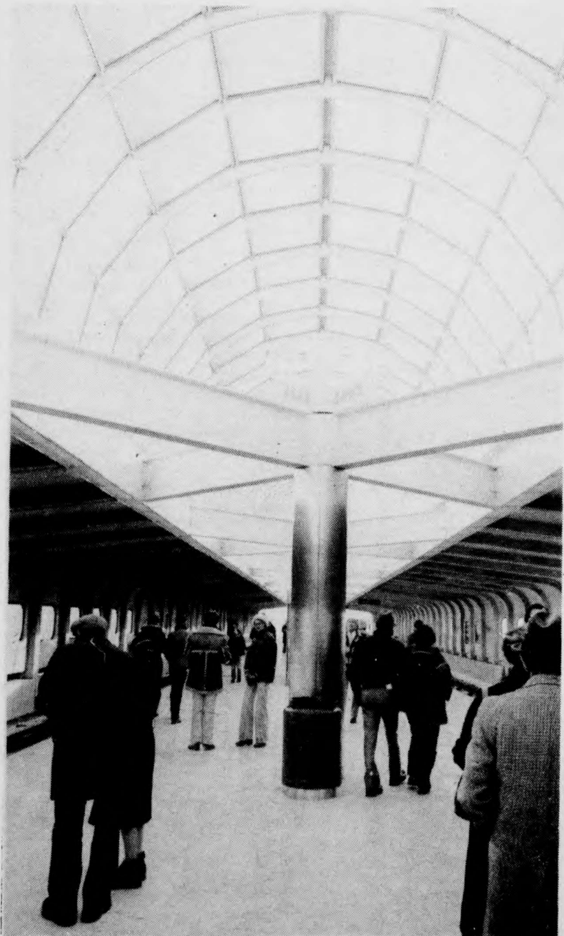
Yorkdale station, end of the line.