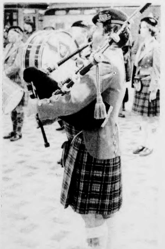
The TTC bagpipe band was in attendance.

The first few days of operation have been marred by switching problems that have seen trains waiting for long periods of time at stations before proceeding onward, but once these are cleared up the new route should be very efficient.