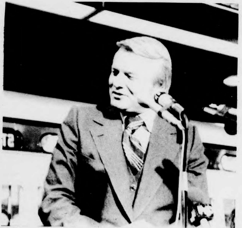
Premier Bill Davis was in good humour during opening ceremonies at St. Clair W. station