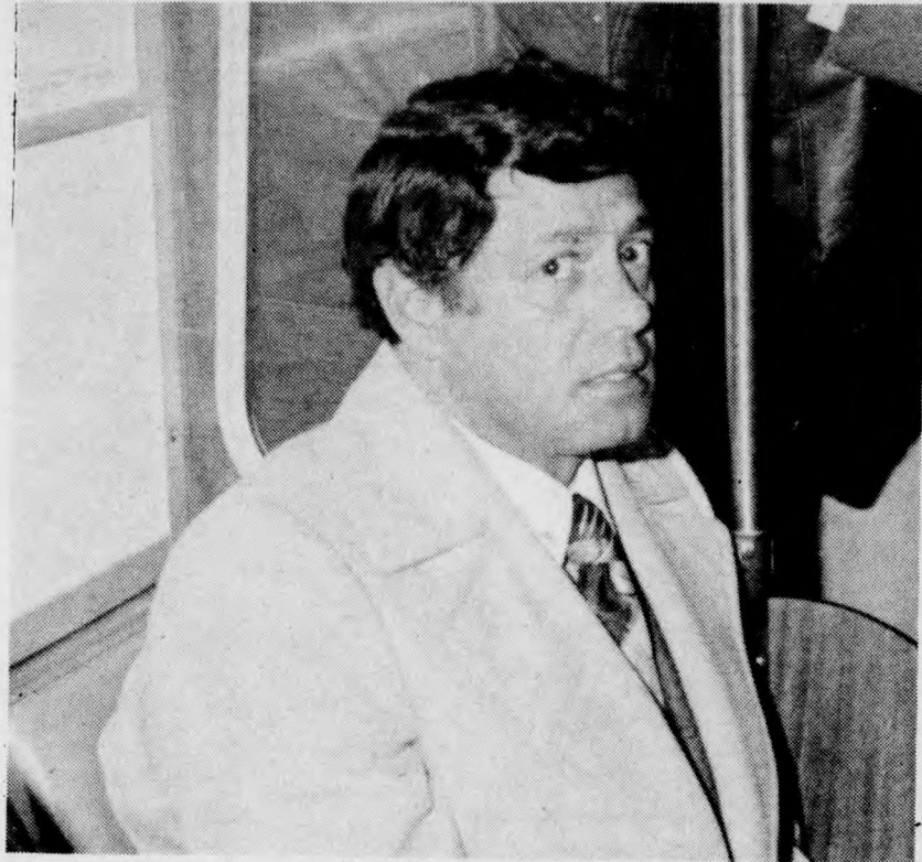
Was North York mayor Mel Lastman suffering from limo withdrawal last Friday as he took a ride on the Spadina?