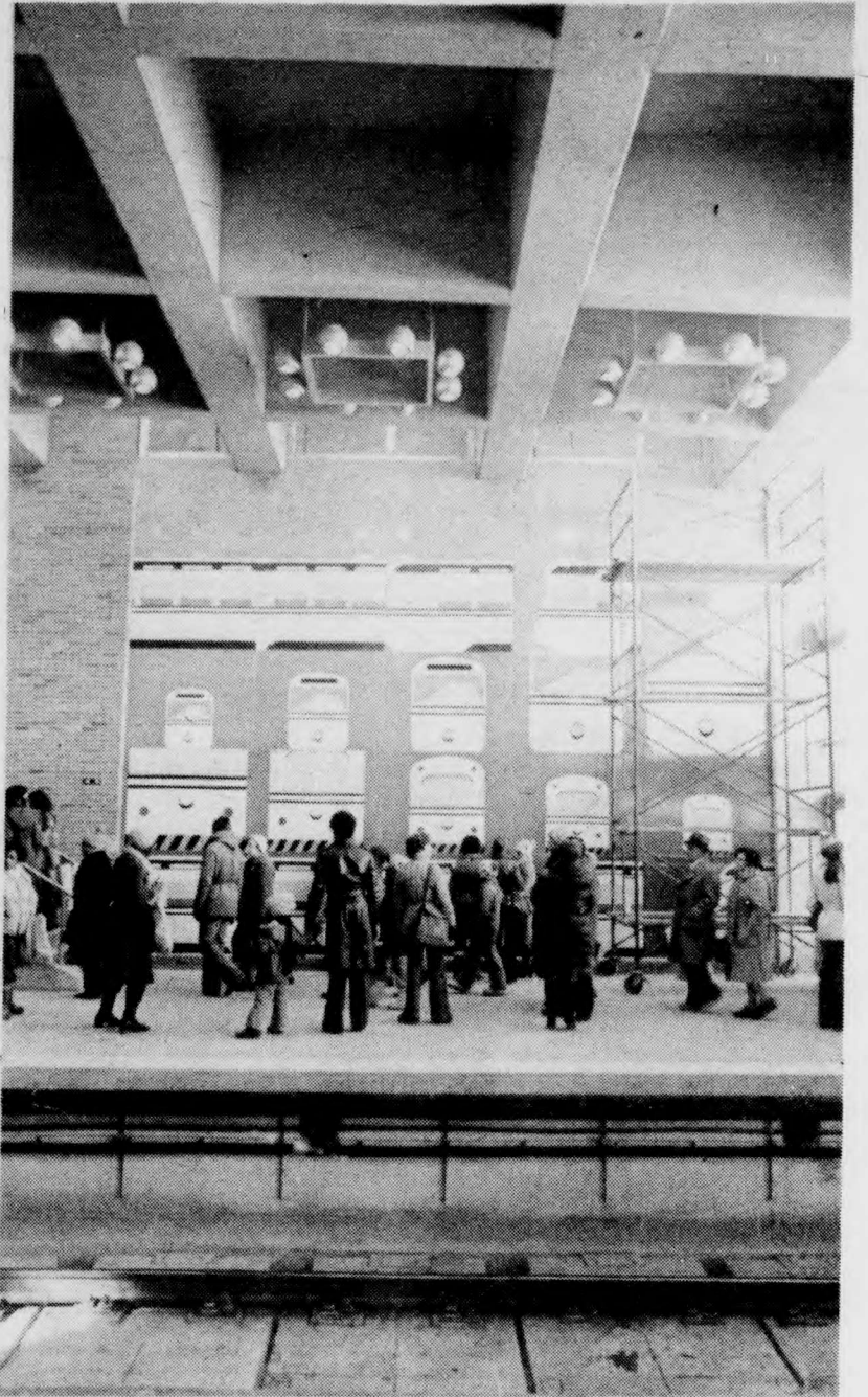
Eglington West station