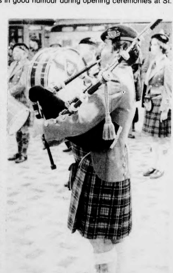
The TTC bagpipe band was in attendance.

The first few days of operation have been marred by switching problems that have seen trains waiting for long periods of time at stations before proceeding onward, but once these are cleared up the new route should be very ef-