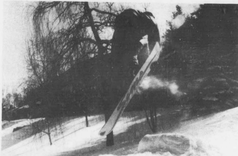
Shawn Dowelling pulling a half cab tail grab. Never limit yourself to skilifts. Hiking and backyard jumps enable you to progress without the hefty price of a lift ticket. ▲