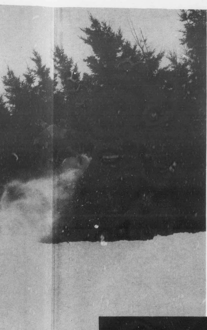
◀◀ Greg Jackson setting up for a late 180 at the snowboard park at Poley Mountain.