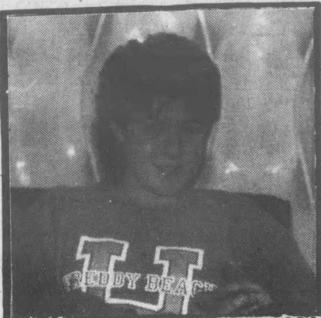
"We live here we should run