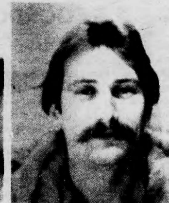
If there is a need for anyone to be brought before the Student Disciplinary Council, common sense should be the underlying