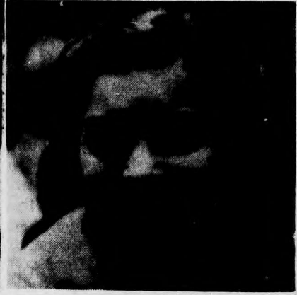
BSc I Prosecute the vandals.