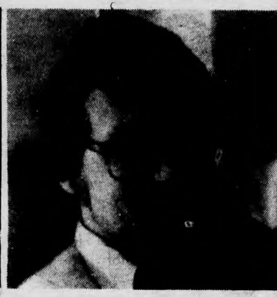
BSc II The vandals should be hung at the break of dawn.