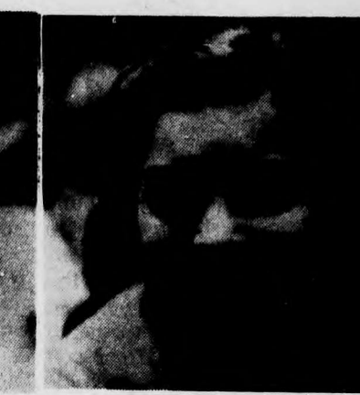
BSc I The vandals should be prosecuted if they do serious damage.