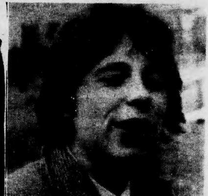
I think we'll have to work on it if