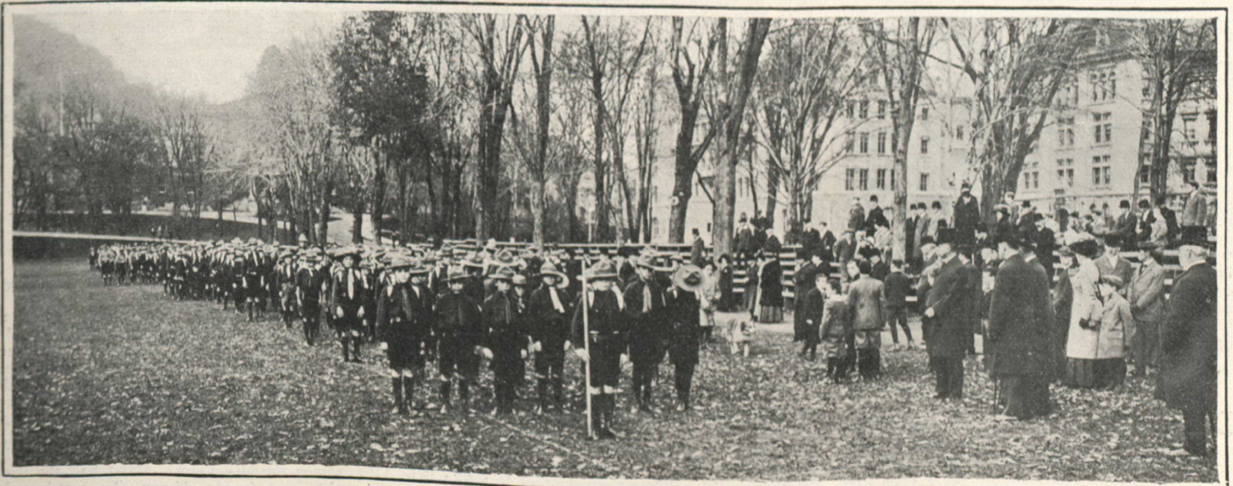
On Sunday last, Toronto had a Garrison Church Parade, but Montreal had something more unusual. This was a Parade of the Montreal Boy Scouts, on McGill Campus, whence they marched to St. George's Church.