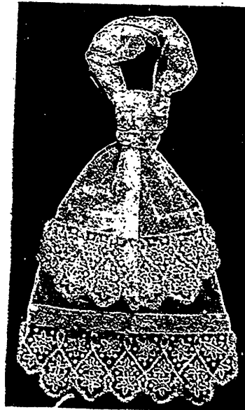
FIGURE NO. 4.—NET SCARF, WITH MODERN LACE ENDS.