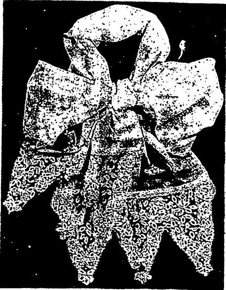
FIGURE NO. 1.—SCARF OF MULL WITH MODERN LACE ENDS.

The "twice-around-the-neck" scarf of mull, chiffon, net or